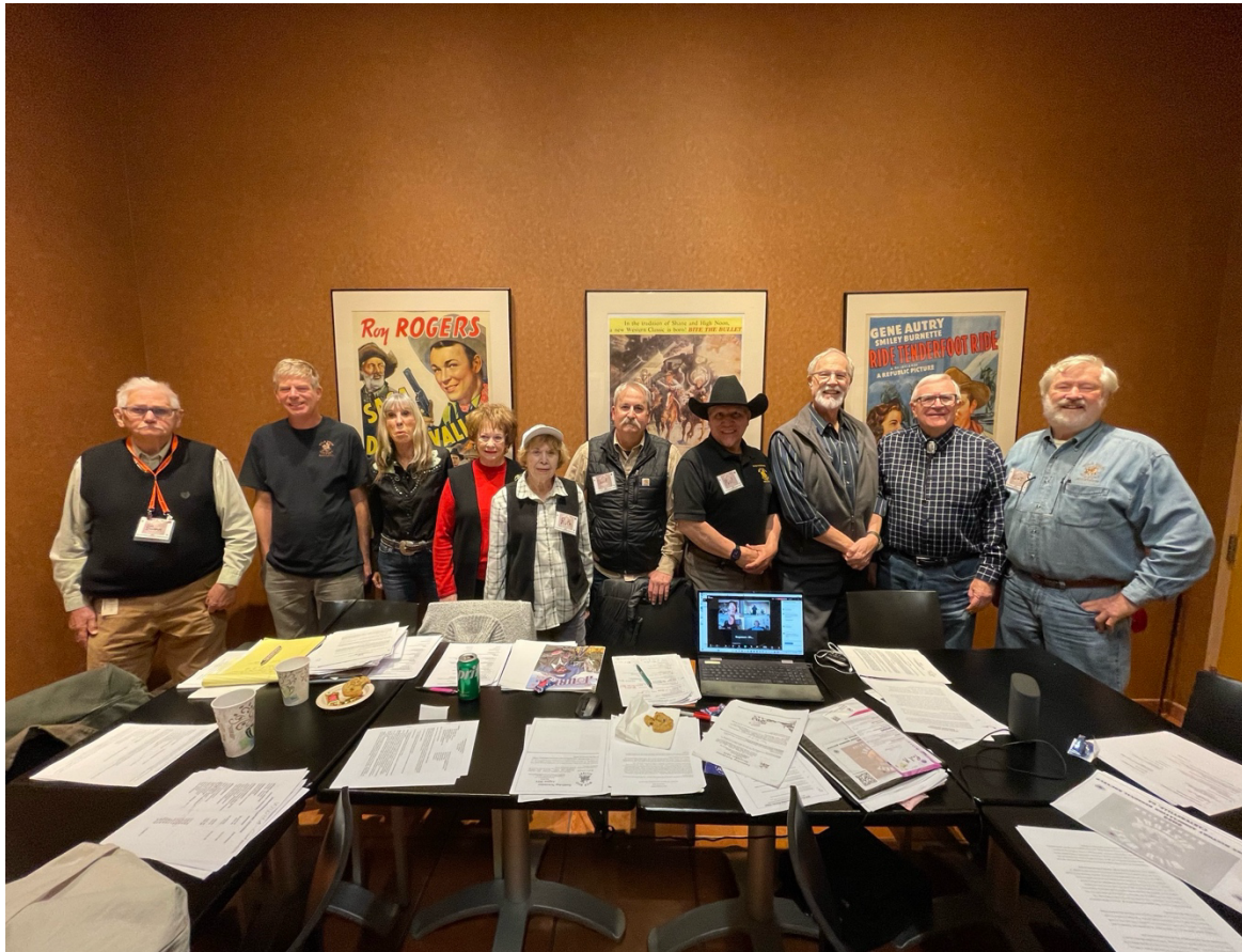
Your Board members.