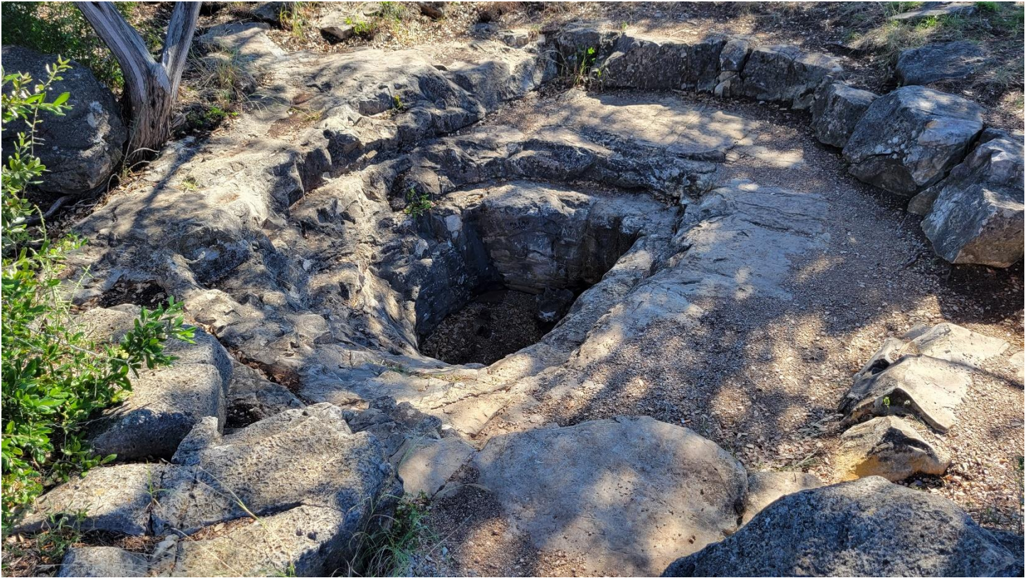
Dead Man's Hole