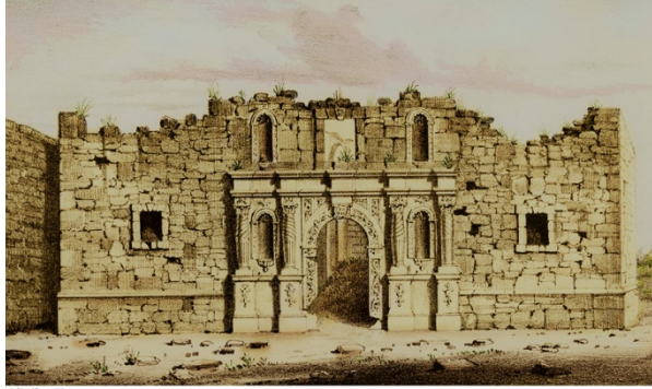
THE CHURCH OF THE ALAMO, SAN ANTONIO DE BEXAR