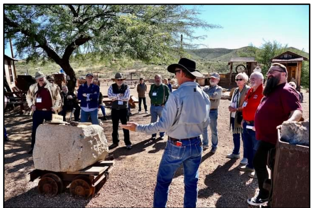
“Good Enough Mine Tour” and Hand Drilling Demonstrations