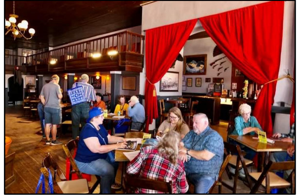
Opening Reception at Oriental Saloon